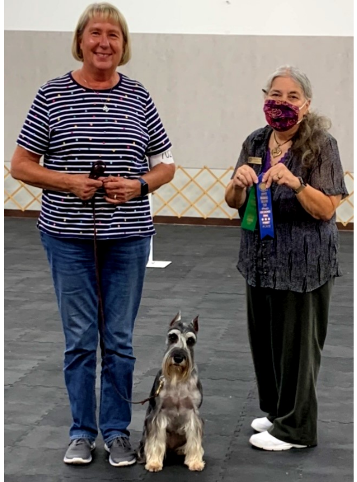
Stahlkrieger's Arsenic and Old Lace CGC TKI BN FCAT2 CGCA SCN CGCU RATN