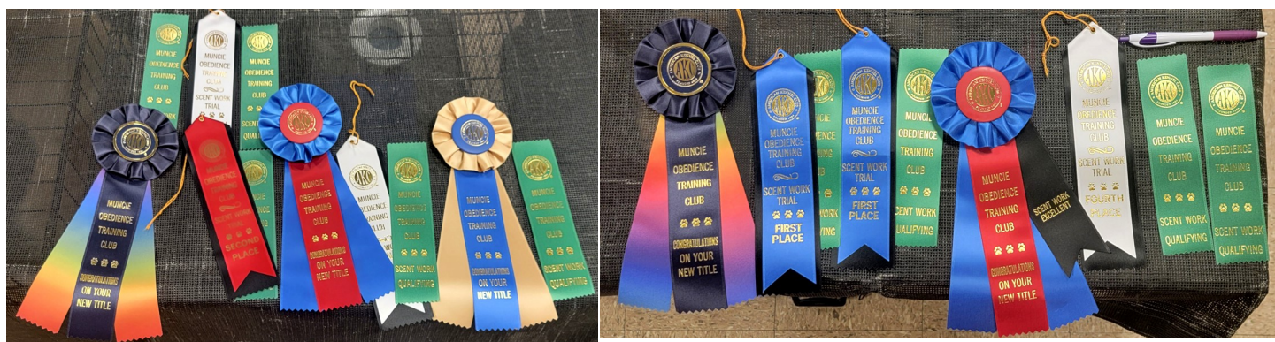
The Becker Chow's Scent Work Awards