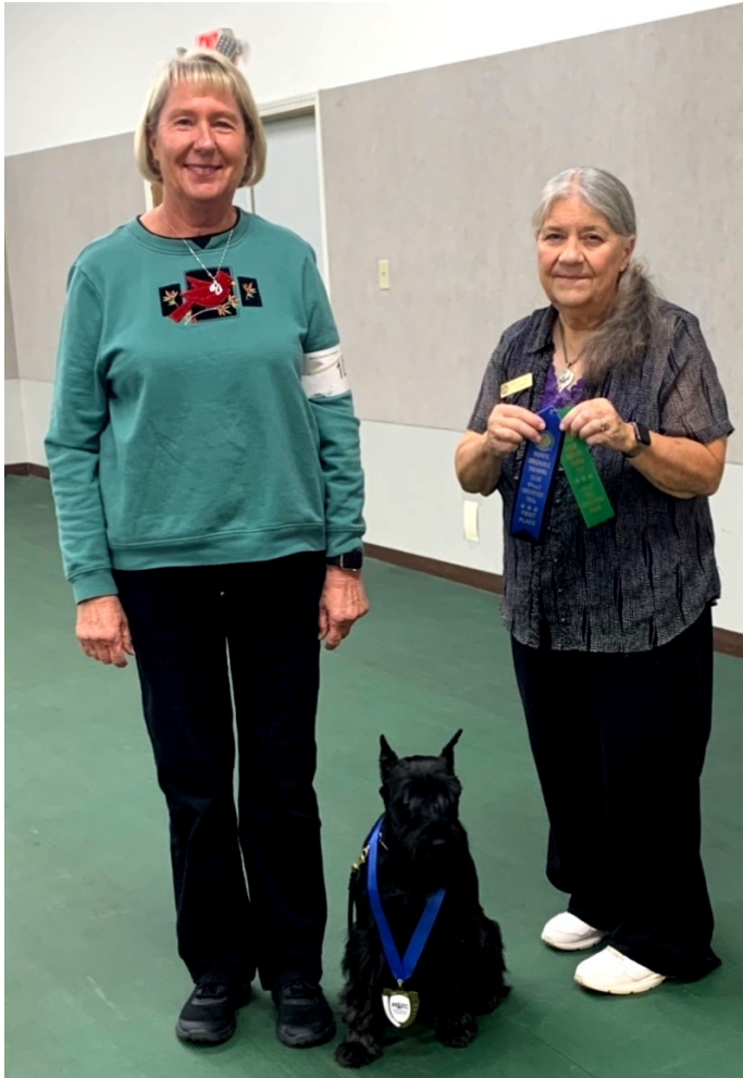
CH Stahlkrieger's Sleeping Beauty CGC TKI BN CD CGCA SIE SCE SBN CGCU FCAT2 RATI

In 2015 I got my first Standard Schnauzer. My research of the breed taught me that they are super smart (known as the breed with a human brain) and that they needed a job. So I signed us both up for puppy class at MOTC. After puppy and family dog class I decided to become a member. I wanted to go farther with my training and I enjoy meeting new people. Now I have two Standard Schnauzers and try to enroll them in activities that we both enjoy doing. We compete in Obedience, Scent Work, Fast Cat, Barn Hunt and some Agility. I believe my very first Obedience title was one of my greatest achievements in the dog sport world because I never really thought we could do it. I have the great instructors at MOTC to thank for helping us accomplish it. When I am not training my dogs I enjoy gardening and working in my yard. That is why I took on the landscaping job here at MOTC, which is a work in progress.